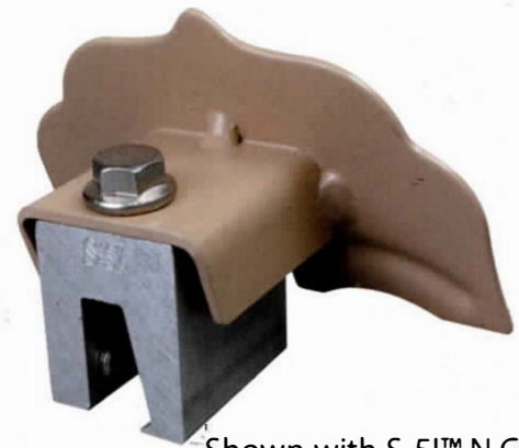
Shown with S-5!™ N Clamp